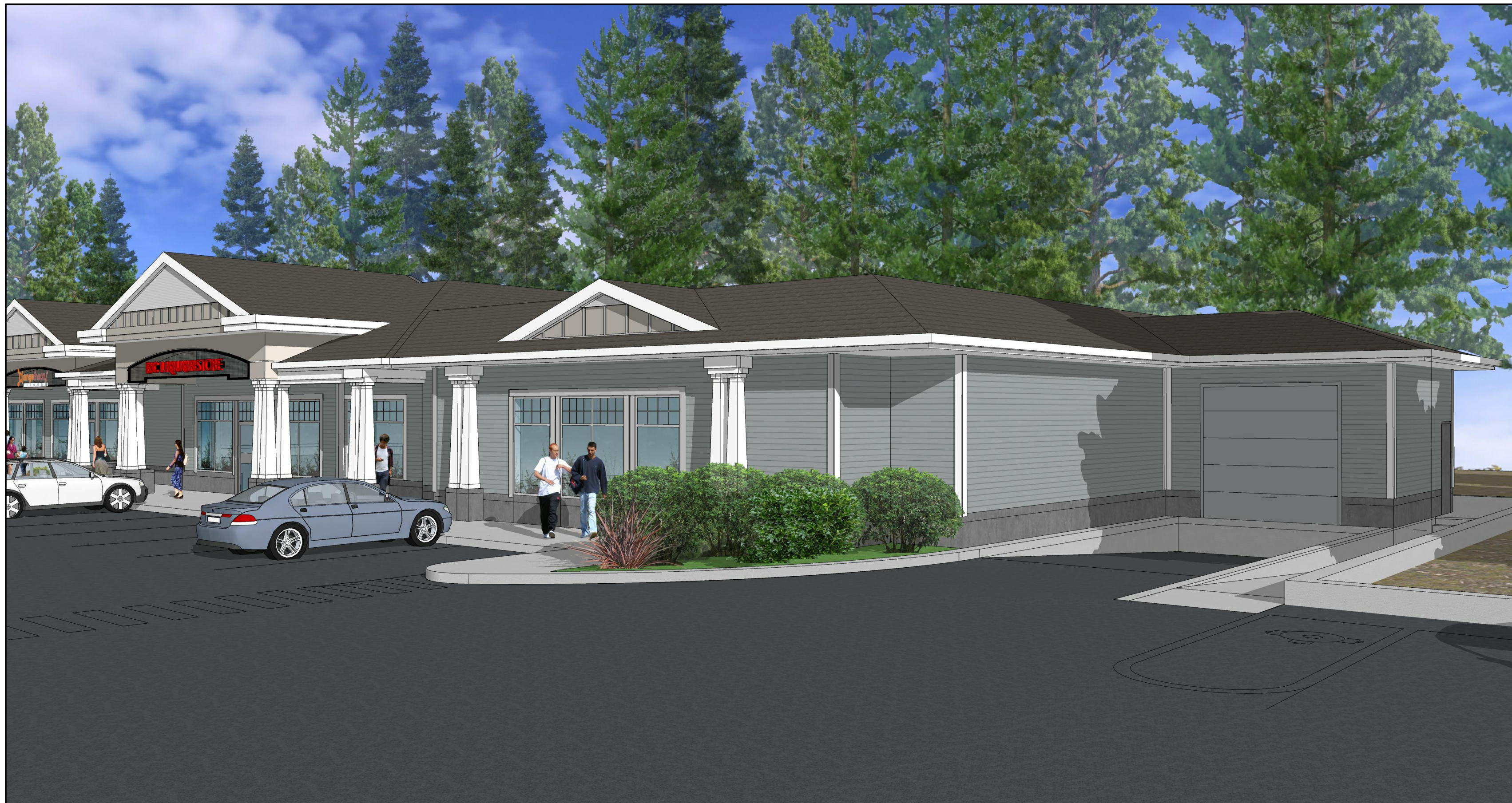
1 VIEW 1 A-3.2 SCALE: NTS