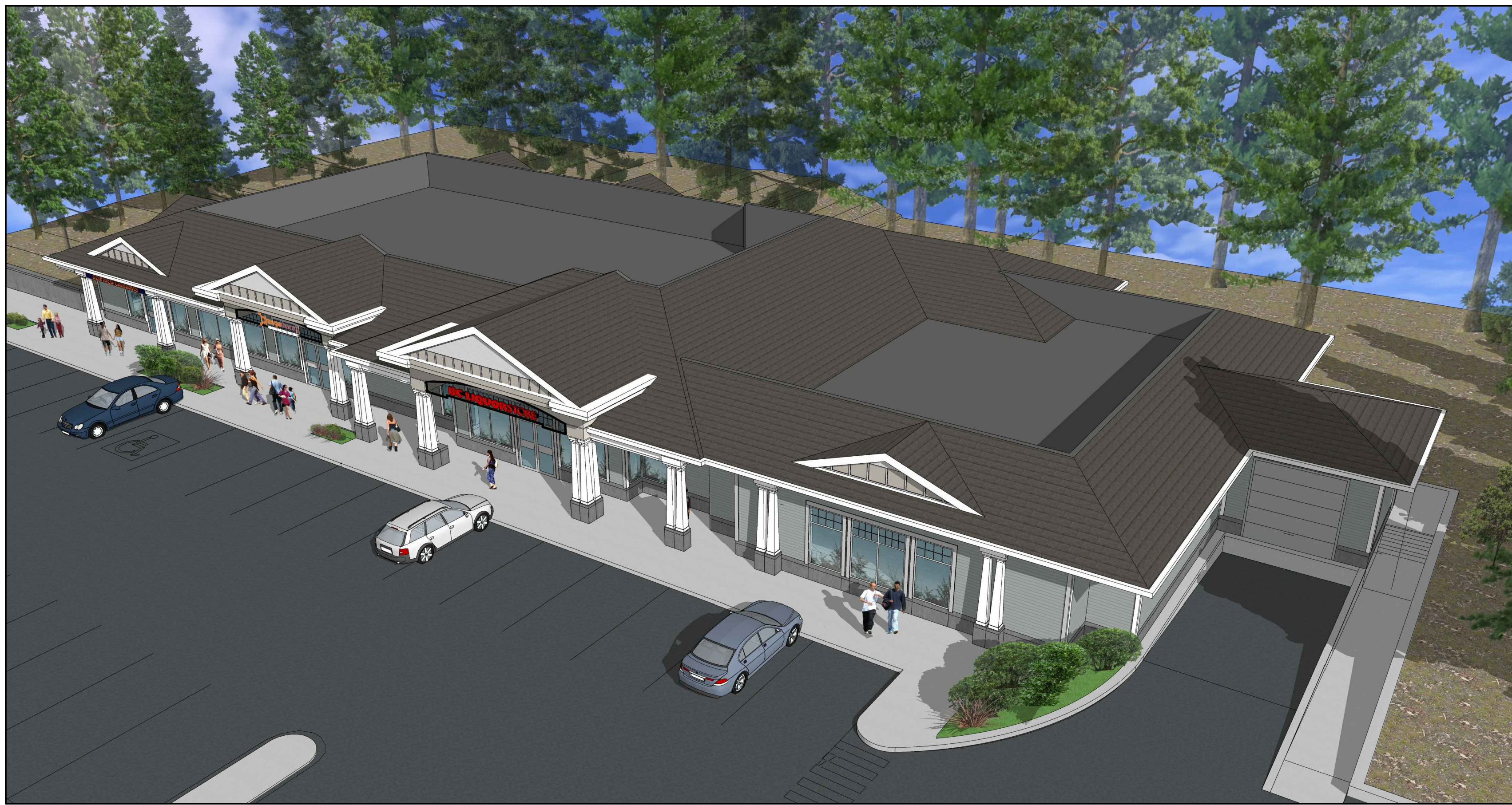
3 VIEW 3 A-3.2 SCALE: NTS