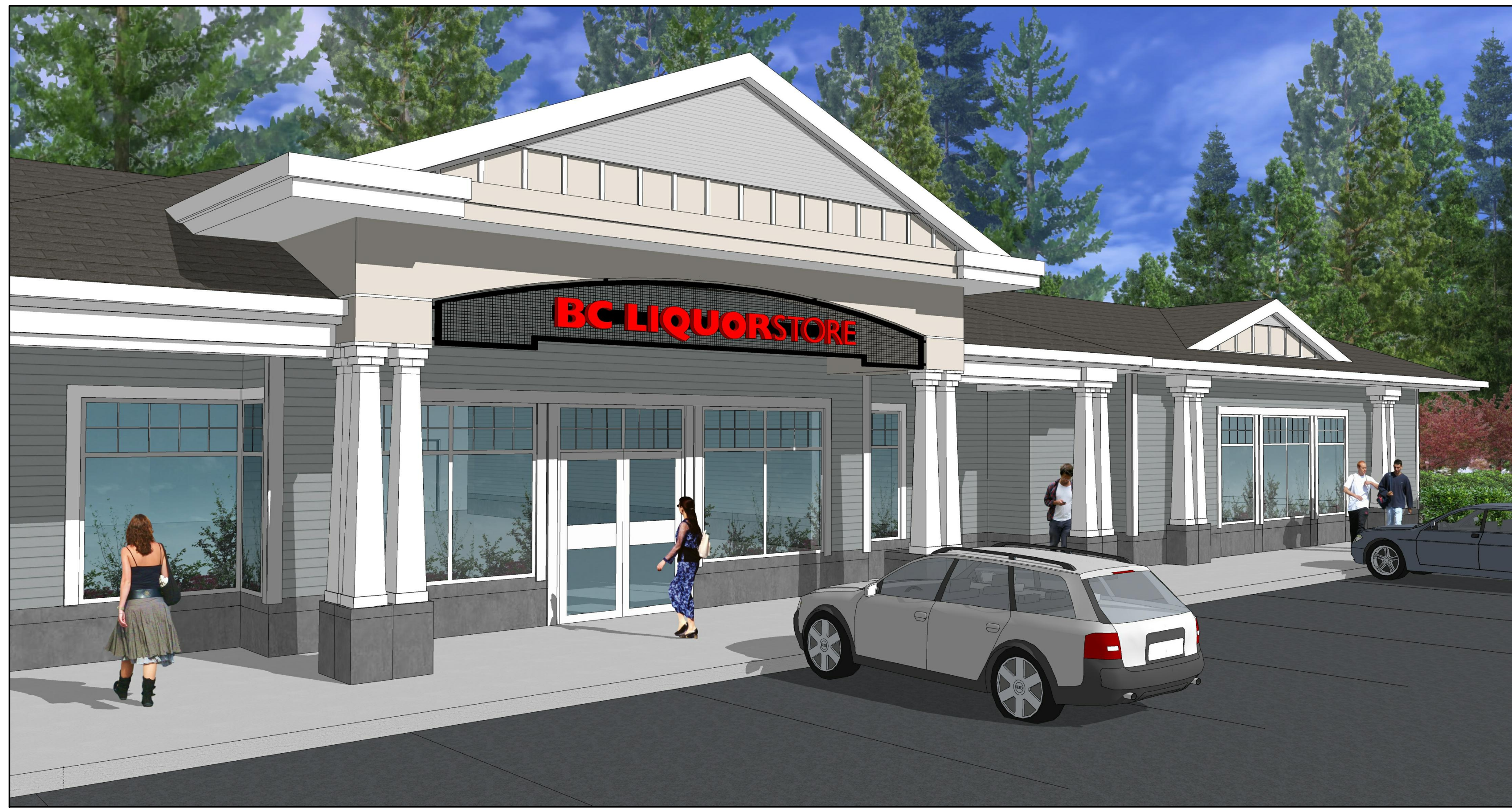
4 VIEW 4 A-3.2 SCALE: NTS