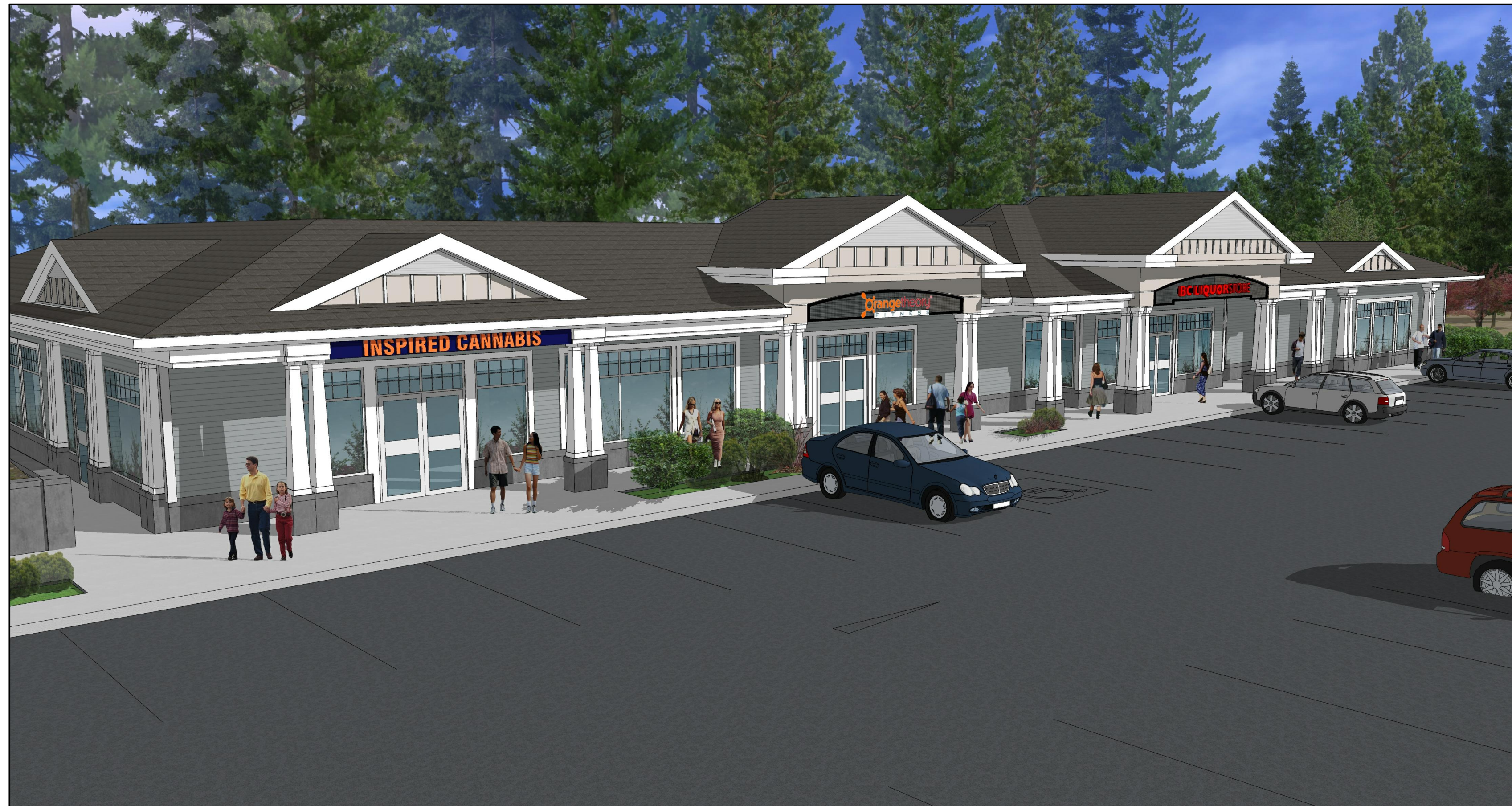
2 VIEW 2 A-3.2 SCALE: NTS